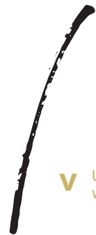
v Use as a steam with roses